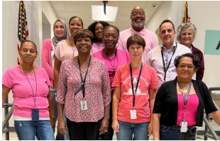
CAMS staff recognizes breast cancer awareness month.

Every Tuesday - BackPack Buddies delivery (See Mr C)